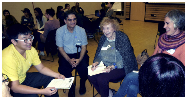
Participants at the 2015 Democracy Café

New this past year, NSCR hosted the Democracy Café which provides North Shore residents a non-partisan opportunity to learn about and participate in democratic life. In 2015, the focus was on the role of our federal government and our election system as part of the fall federal election.