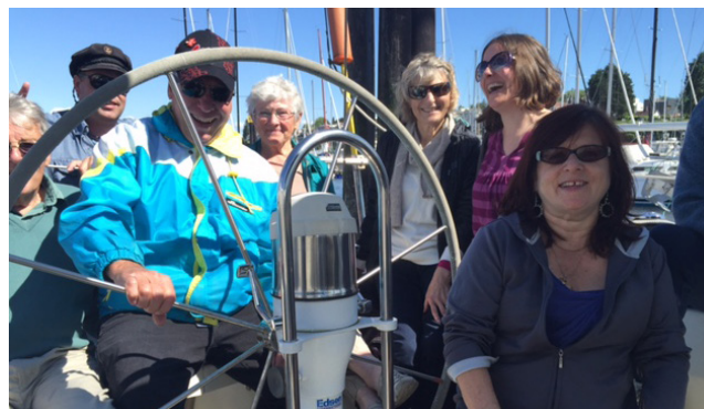
Caregiver Support Program participants enjoy a day on the water